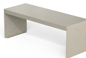
Table composed of two 5mm-thick steel sheet supports and a table top made of 40x20x1.5 mm (top) and 40x100x2 mm (side) steel tubes, with 3 mm thick steel sheet connection brackets. All metal parts are galvanised and coated with thermosetting polyester powder. All fixings are in AISI304 stainless steel. prepared with holes Ø 12 mm at the base for ground fixing with mechanical dowels (not included).